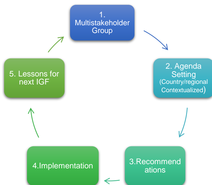
Figure 2: IGF Process Cycle